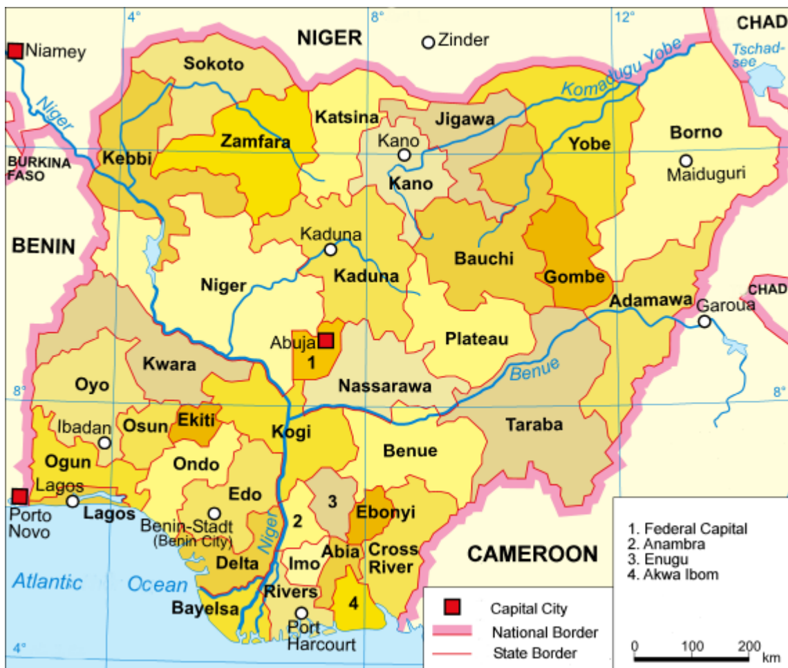
Fig. 3.1: Geographical map of Nigeria